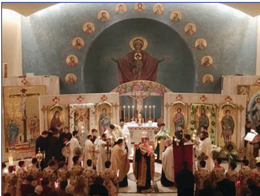
St. John the Baptist Feast Day 2018