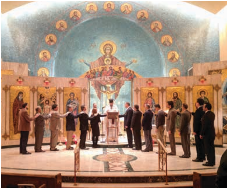
2018 Parish Council members are sworn into office.

St. John the Baptist Greek Orthodox Church 2350 Dempster Avenue Des Plaines, IL 60016 (847) 827-5510 www.stjohnthebaptistgoc.org