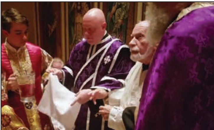
His Eminence at the Washing of the Feet service at St. John the Baptist - Holy Week 2017