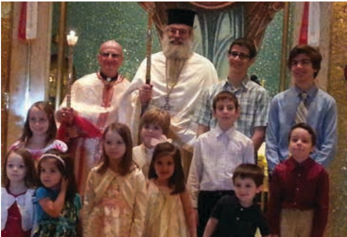
A look back to Easter of 2013. The photo was taken after the Agape Service.

St. John the Baptist Greek Orthodox Church 2350 Dempster Avenue Des Plaines, IL 60016 (847) 827-5510 www.stjohnthebaptistgoc.org