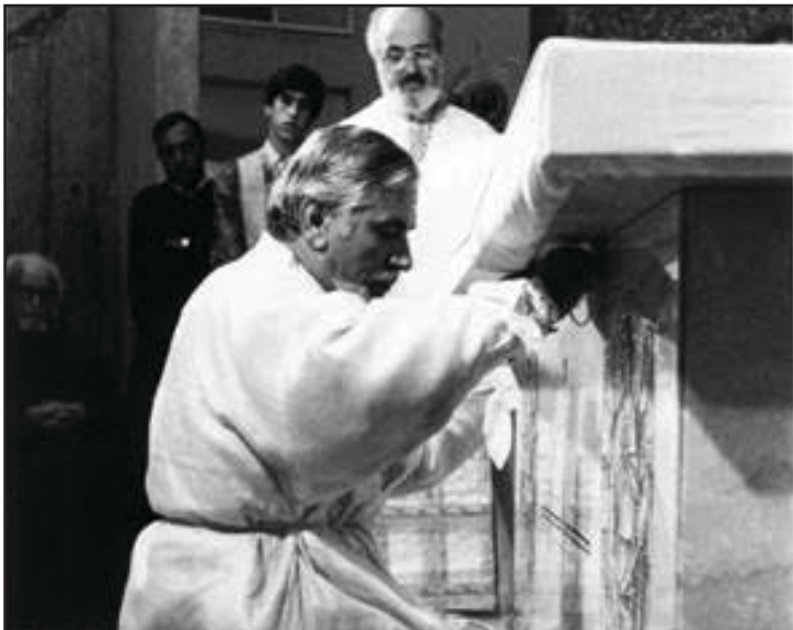
Our parish was the first parish His Eminence consecrated on October 7, 1979.