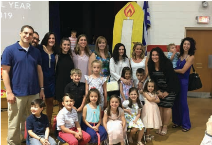
Above: Members of GOYA 1997-2001 and their children in GAODS preschool

St. John the Baptist Greek Orthodox Church 2350 Dempster Avenue Des Plaines, IL 60016 (847) 827-5510 www.stjohnthebaptistgoc.org